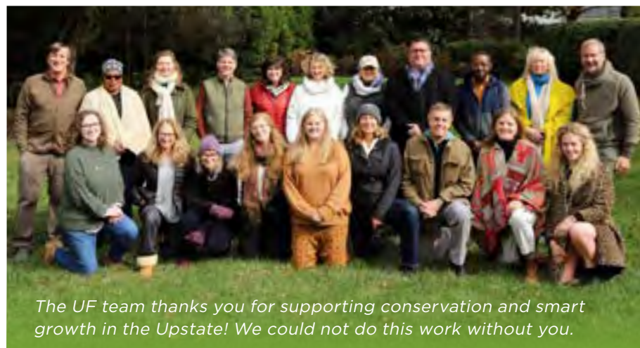
The UF team thanks you for supporting conservation and smart growth in the Upstate! We could not do this work without you.