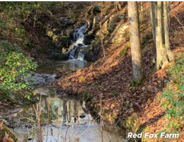
Red Fox Farm