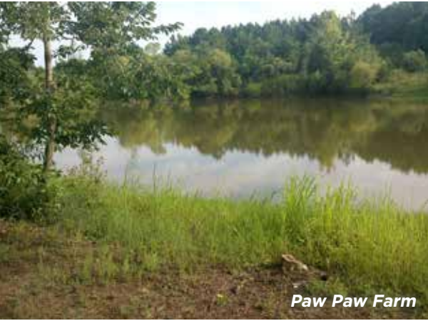
Paw Paw Farm