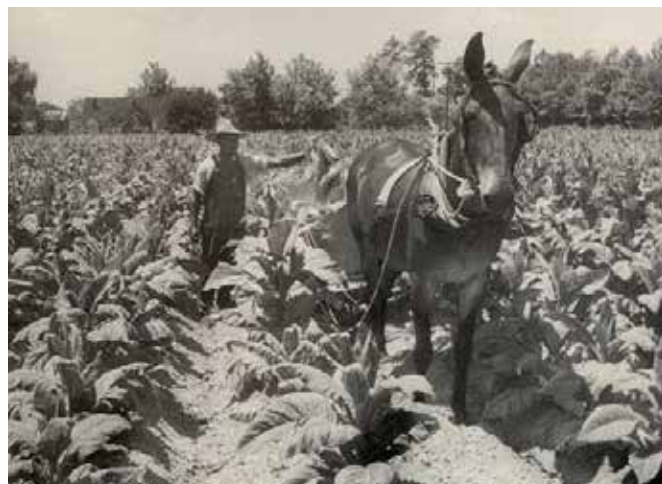
An African American man on a tobacco farm in North Carolina ca. 1940.