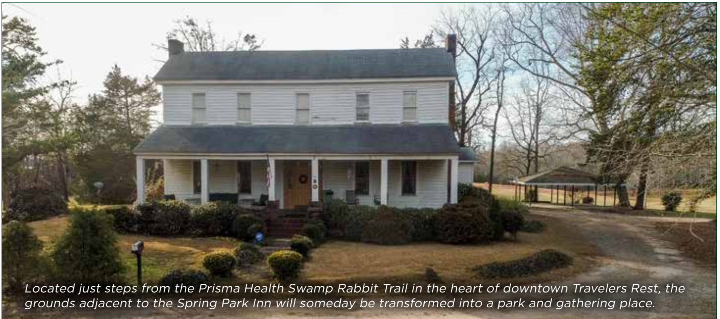
Located just steps from the Prisma Health Swamp Rabbit Trail in the heart of downtown Travelers Rest, the grounds adjacent to the Spring Park Inn will someday be transformed into a park and gathering place.