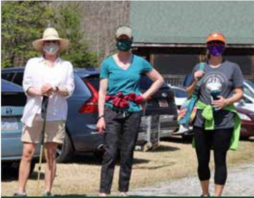
UF team members "smile" for a photo before a masked hike to Brasstown Falls in Oconee County at a recent Staff Fun Day.