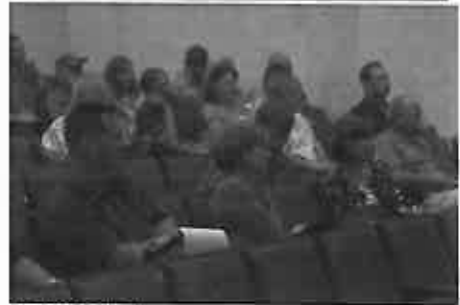
Purchase this Photo